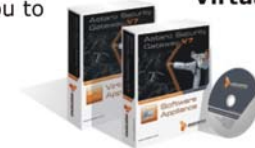
Astaro Software & Virtual Appliances