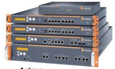
Astaro Hardware Appliances