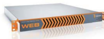
Astaro Web Gateway 3000