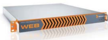
Astaro Web Gateway 2000