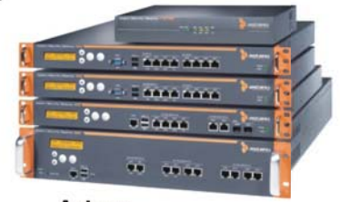
Astaro Hardware Appliances

Ready-to-go virtual machines for VMware environments, helping you to consolidate your IT infrastructure.