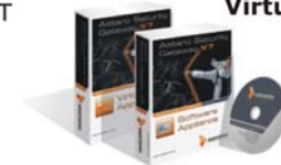
Astaro Software & Virtual Appliances